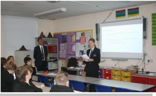
Year 8: Fire Safety Workshop & Debating Class